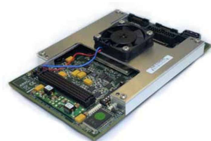
LogicTile Express 3MG with ARM Cortex-R5 SMM

The implementation uses standard ARM CoreLink™ System IP components to implement a basic SoC design to mimic the test chip developments of our CoreTile Express products.